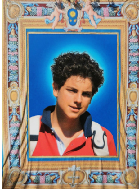
Carlo Acutis is pictured on the booklet for his beatification Mass in Assisi, Italy, Oct. 10.