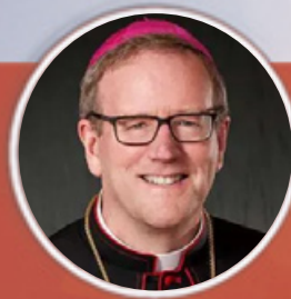
FEATURING BISHOP ROBERT BARRON RECIPIENT OF FOUNDERS AWARD