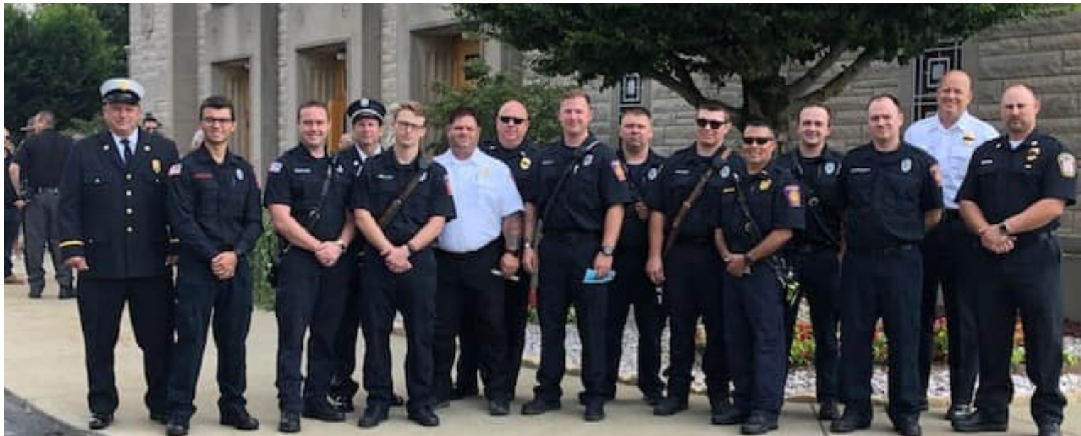
Weirton-area police, firefighters, members of the military, and other first responders are pictured after the Blue Mass celebrated at St. Joseph the Worker Church in Weirton Sept. 10.