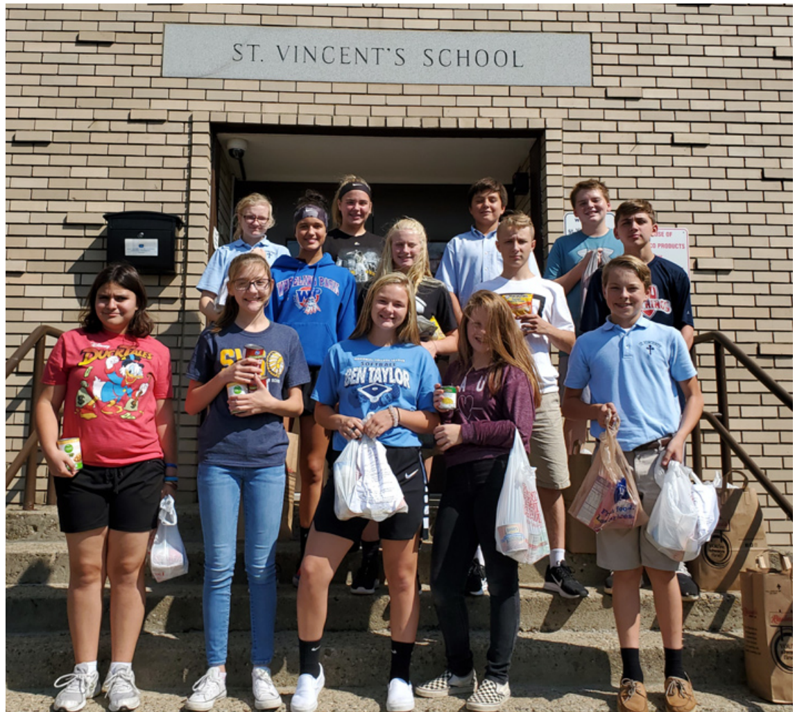
St. Vincent de Paul Parish School, Wheeling