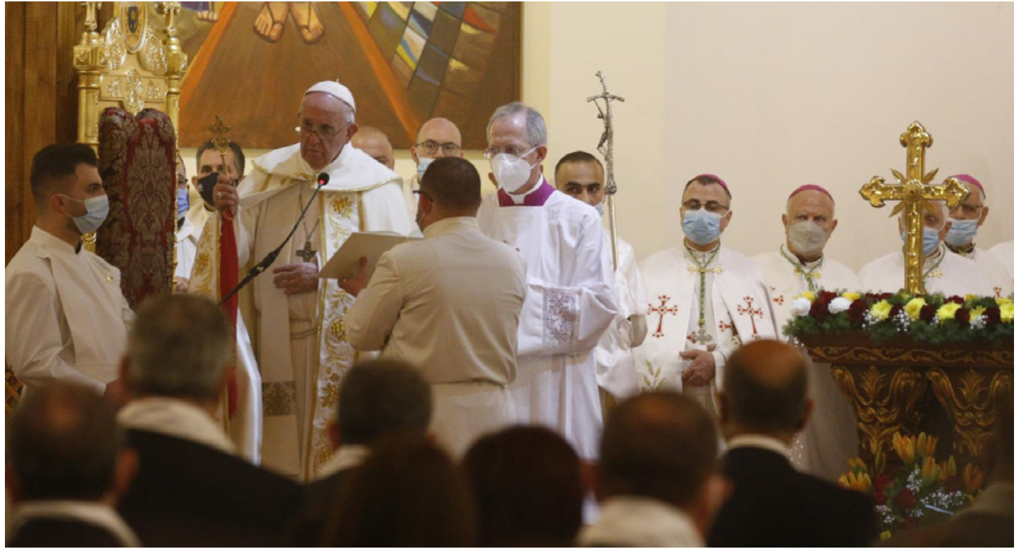
Pope Francis celebrates Mass at St. Joseph Chaldean Catholic Cathedral in Baghdad March 6.

In his homily, Pope Francis told the people that while “in the eyes of the world, those with less are discarded, while those with more are