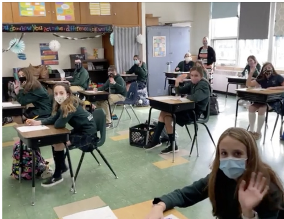
Seventh graders at St. Paul School in Weirton wave to viewers of the live, virtual open house.