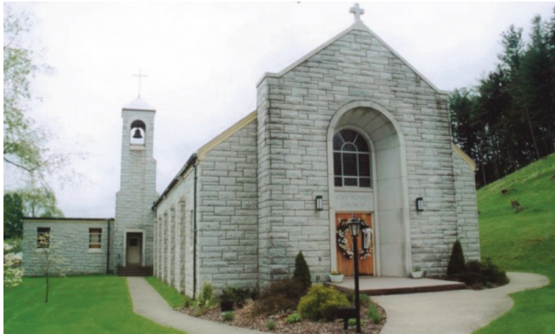
Pictured is Holy Rosary Church in Buckhannon, which has been served by Marists priests and religious for 118 years.