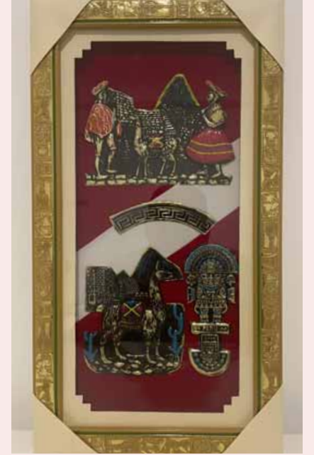
Raffle prizes are from left: a painting of St. Rose, an Incan bull figurine, and a framed Incan artwork. The majority of proceeds from the raffle will benefit needy children and senior adults.

In honor of St. Rose's commitment to the poor, raffle tickets are being sold, the majority of proceeds from which will benefit needy children and senior adults.