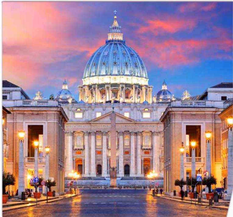
September 2nd through the 11th, 2025